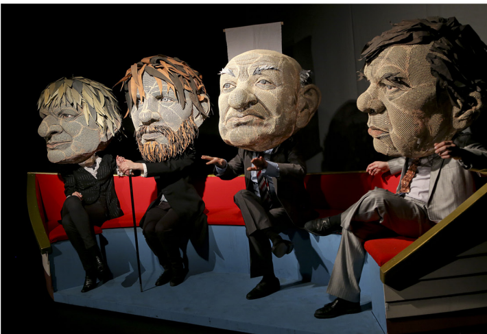
MOBY DICK VS. A.H.A.B. Puppetsdesign and Building Schauspiel Dortmund P.: 28.03.2015