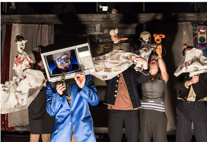
M – Eine Stadt sucht einen Mörder Puppetsdesign and Building Puppentheater Magdeburg P.: 02.04.2016